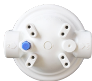
Multiple mounting bolt configurations