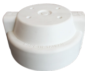
Flat cap design (1/4" & 3/8" connection cap)