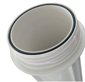
Recess mounted top O-ring design