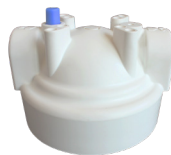
Round cap with optional relief valve (1/2" & 3/4" connection cap only)