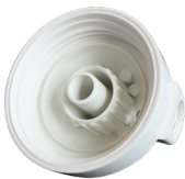
Internal cap view

Does your water source suffer from contaminants, sediment, or odors? GWS filter housings are the first step in solving your drinking water needs. Built with the highest quality virgin materials and reinforced to withstand the highest pressures, our filter housings can be used with a wide assortment of cartridges and media for applications in homes, restaurants, industry, and anywhere clean drinking water is a must.