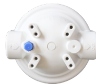
Multiple mounting bolt configurations