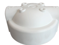
Round cap design (1/4" & 3/8" connection cap) Only available with the short ribbed sump