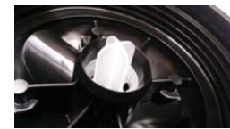
Removable filter cartridge centering plug