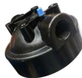
Housing cap with Pressure Relief Valve (PRV)