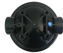
Housing cap mounting bolt hole design