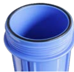
Single recess top mounted O-ring