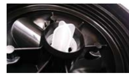
Removable filter cartridge centering plug