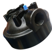
Housing cap with Pressure Relief Valve (PRV)

Does your water source suffer from contaminants, sediment, or odors? GWS filter housings are the first step in solving your drinking water needs. Built with the highest quality virgin materials and reinforced to withstand the highest pressures, our filter housings can be used with a wide assortment of cartridges and media for applications in homes, restaurants, industry, and anywhere clean drinking water is a must.