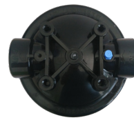
Housing cap mounting bolt hole design