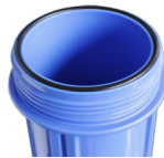
Single recess top mounted O-ring