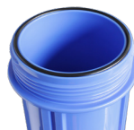
Single recess top mounted O-ring