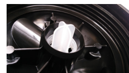
Removable filter cartridge centering plug